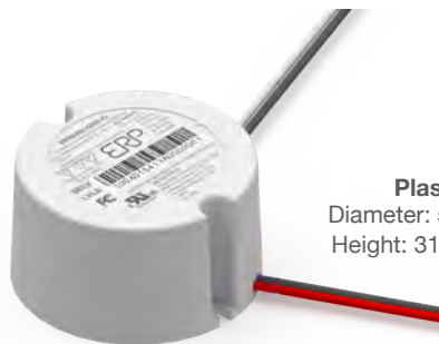
Plastic Case Diameter: 58 mm (2.28 in) Height: 31.7 mm (1.25 in)