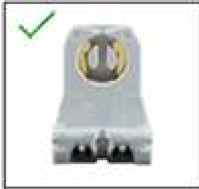
Non-Shunted(rapid Start Socket)