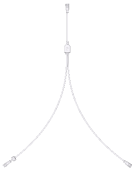
Y-Type connecting cord