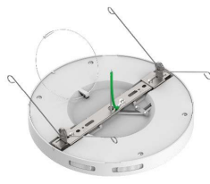
7" & 12"