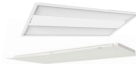
Troffer Transformer (Flat panel, Volumetric)