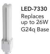
LED-7330 Replaces up to 26W G24q Base

**Shipped with horizontal-to-vertical adapter LED-7317-ARM. May not fit in all 6" cans; test-for-fit.