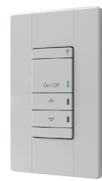
nLight AIR rPODBA