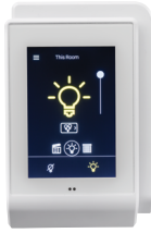
nLight WIRED nPOD UNITOUCH