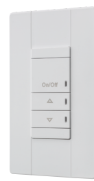
nLight WIRED nPODMA DX