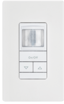
Sensor Switch WSXA D